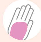
Hand Smoothing Kit