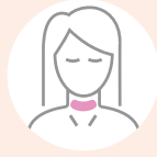
Neck Smoothing Kit