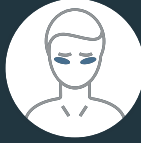
Eye Smoothing Kit