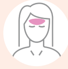
Forehead Smoothing Kit