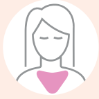
Chest Smoothing Kit

100% Medical Grade Silicone Pads to treat wrinkles