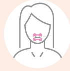
Mouth Smoothing Kit