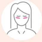
Eye Smoothing Kit